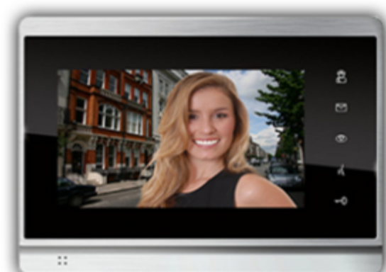
7" Touchscreen Resident Monitor