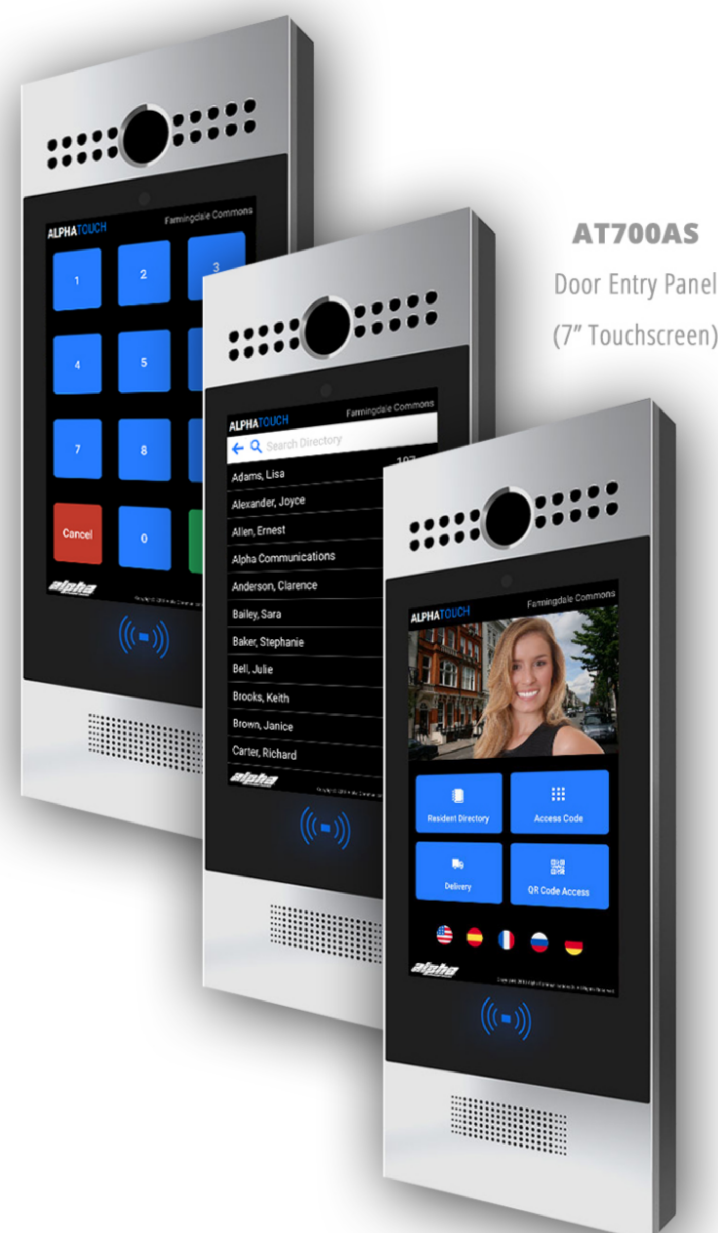
AT700AS Door Entry Panel (7" Touchscreen)