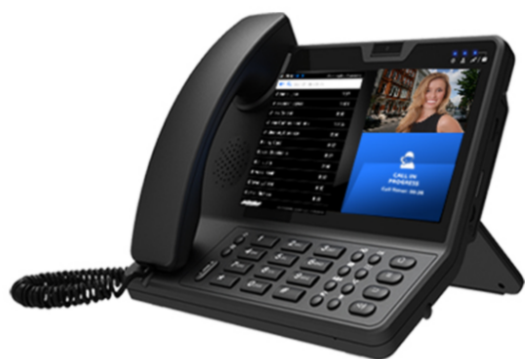
7" Touchscreen Staff or Concierge Station (with privacy handset)