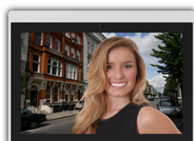
10" Touchscreen Resident Monitor (Optional Camera for 2-way video)